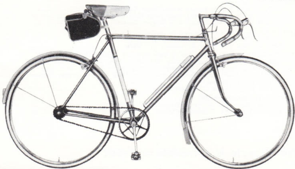
'Speedster' Special Sports