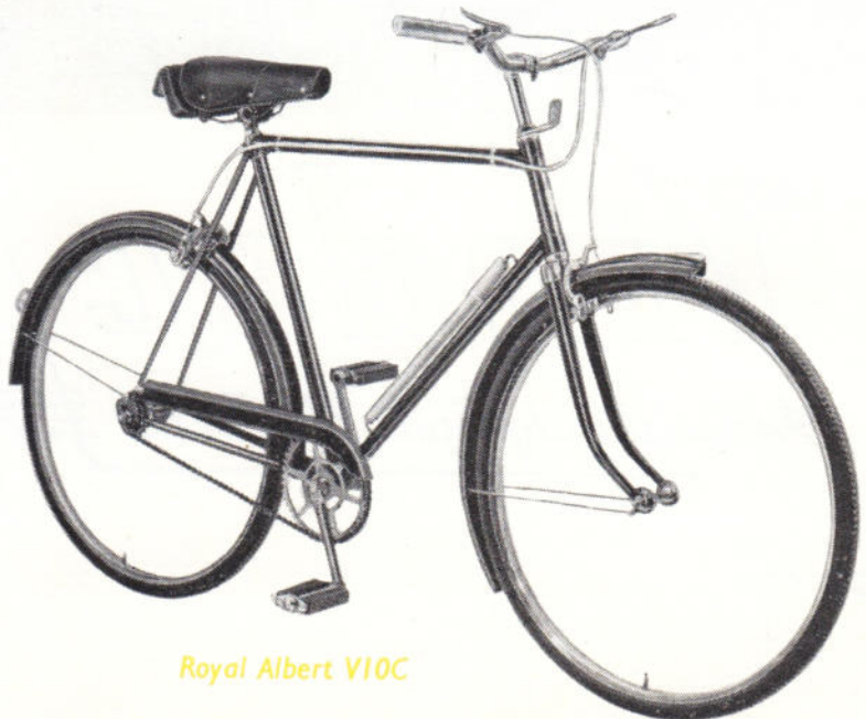
Royal Albert V10C