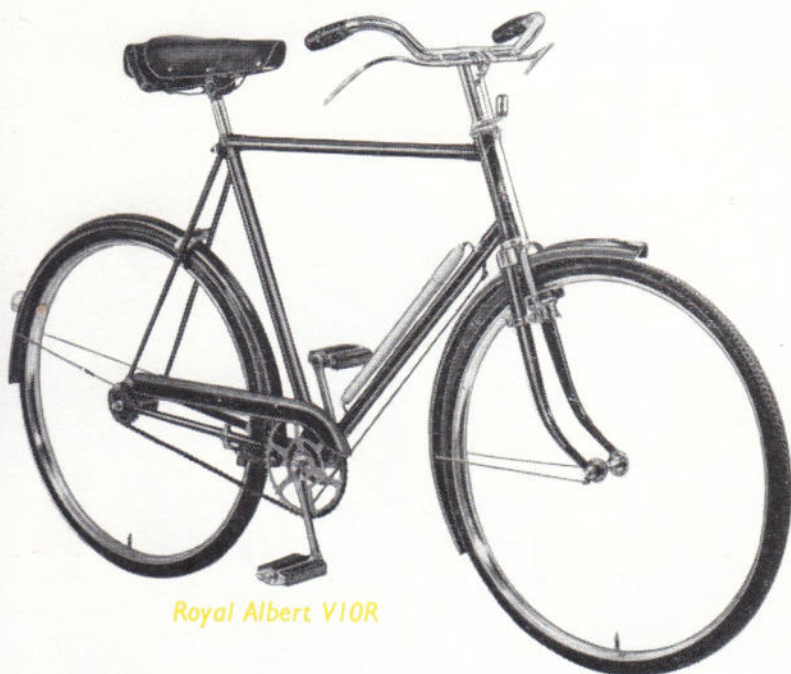
Royal Albert V10R

With Sturmey Archer 3-speed Gear and GH6 Dynohub lighting £23 15s. 0d. incl. P. Tax.